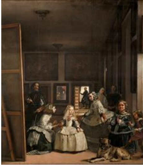
Image 2. Diego Velazquez, Las Meninas , 1656, 318x276 cm