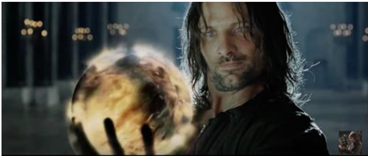
Image 16: The Lord of the Rings III, 2003 – The Return of the King (Original Scene)

This fact that the cat in the original movie moves to left from the right side while in the poster the cat moves right from the left is might be barely noticed by the people even who know the movie very well. In this artwork, the artist began his creation from ideological means.