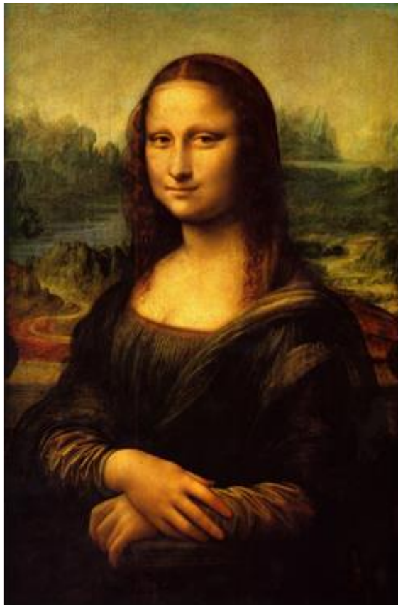
Image 4. Leonardo da Vinci, Mona Lisa 16th century