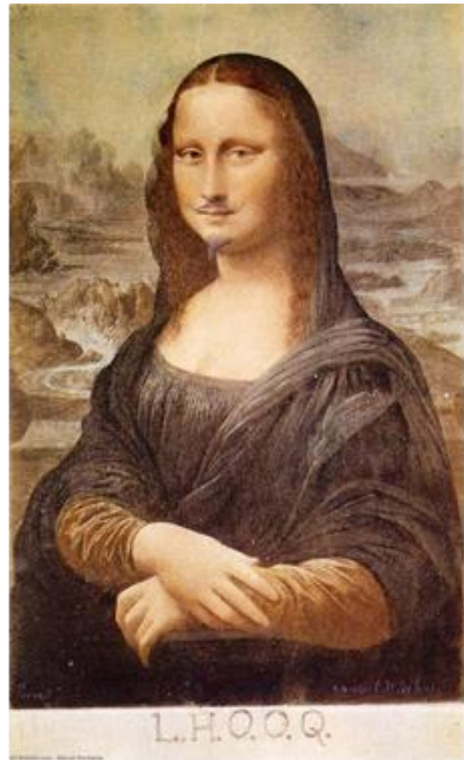
Image 5. Marcel Duchamp, L.H.O.O.Q. 1919