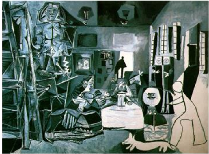
Image 3. Pablo Picasso, Las Meninas , 1957, 194x260 cm